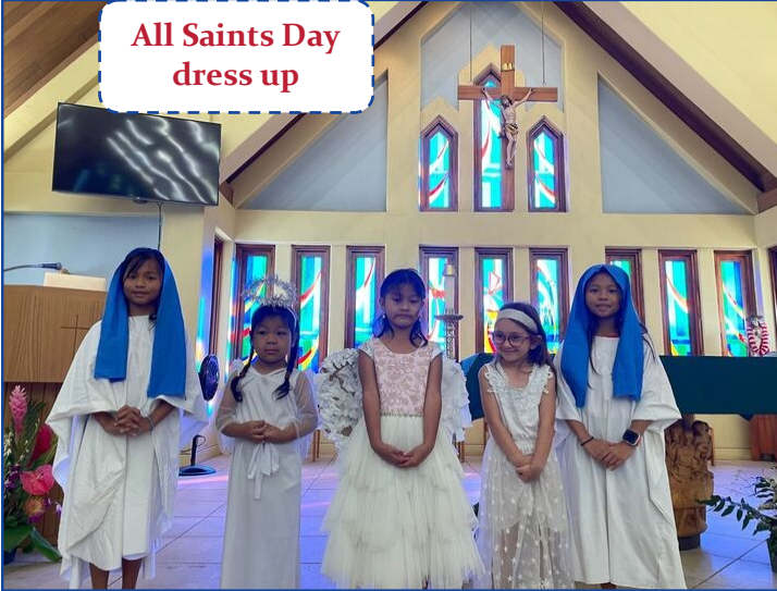
All Saints Day dress up