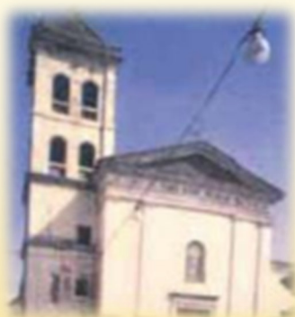
The façade of the church of San Mauro

On the night of July 25, 1969, some thieves broke into the parish church of San Mauro la Bruca with the intention of stealing some of the more precious objects. After they had pried open the tabernacle, they took a ciborium containing many consecrated Hosts. Once they left the church, the thieves emptied the ciborium and threw the Hosts on a footpath. On the following morning, a child noticed the pile of Hosts at the intersection of the road and gathering them up, he immediately gave them to the pastor. It was only in 1994, after 25 years of detailed analysis, that Msgr. Biagio D'Agostino, Bishop of Vallo della Lucania, acknowledged the miraculous preservation of the Hosts and authorized the cult. The conclusion of any chemical and scientific analysis acknowledges that after just 6 months wheat flour severely deteriorates and in a few years turns gelatinous and then, finally, to dust.