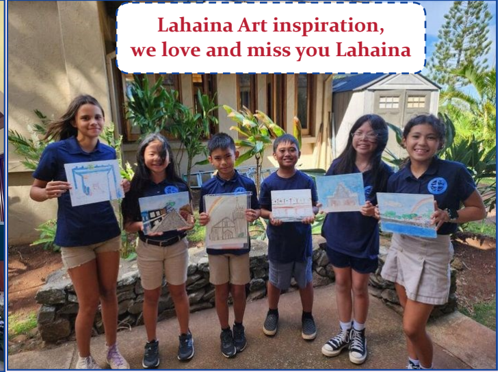
Mahalo, HEAL MAUI, for your second generous donation to our makeshift school.