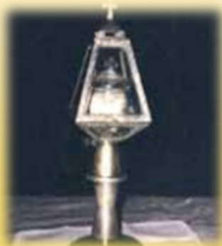
The niche where the miraculous Hosts are preserved