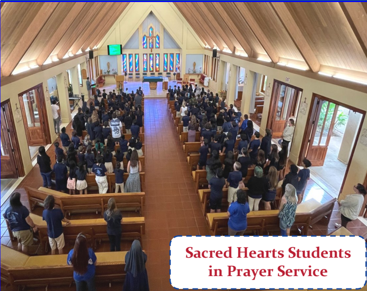
Sacred Hearts Students in Prayer Service